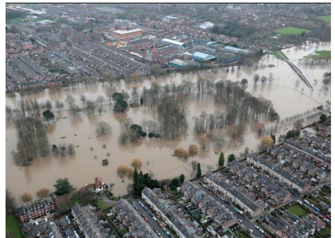
Flooding by Rowntree Park and Millennium Bridge

On 22 May, we are holding a public event which will focus on the options for reducing flood risk between Rowntree Park and St Chad's Wharf.